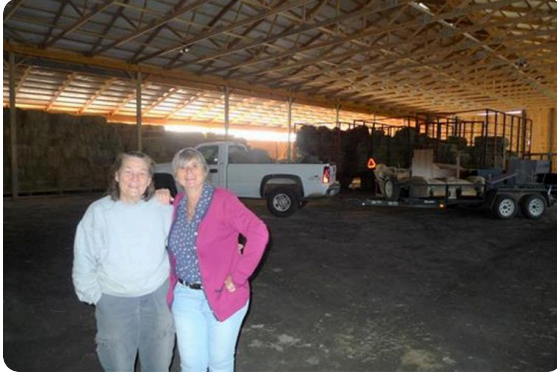
In the barn